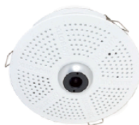
c26 with lens B036